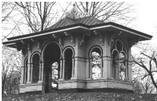
Druid Hill Park, Baltimore, Maryland